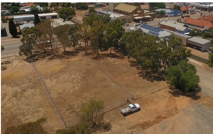
Below: Fencing is up and gates are going on at the Dog Park