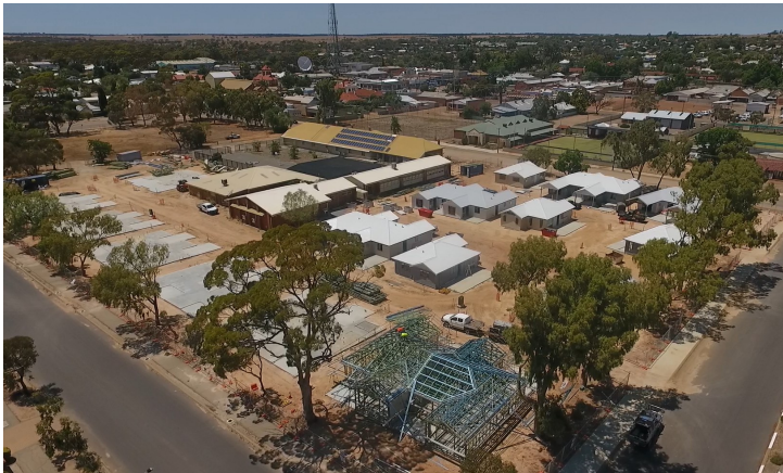
Above: Work steadily progressing with the Independent Living Units