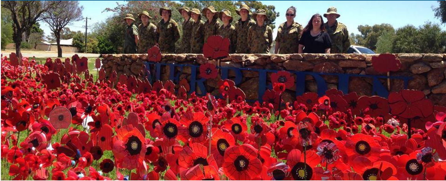
The Merredin community handmade poppies were planted again for Remembrance Day, led by the Merredin 510 Army Cadet Unit.