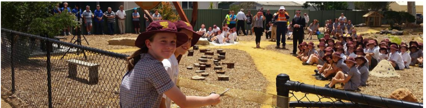
Above: Lenihan Park, adopted and designed by St Mary's students, is officially opened