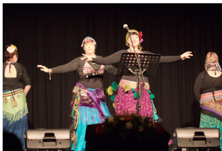
Merredin College Choir and Gypsy Tribal Belly Dancers performing at the 2016 ANZAC Day Variety Show