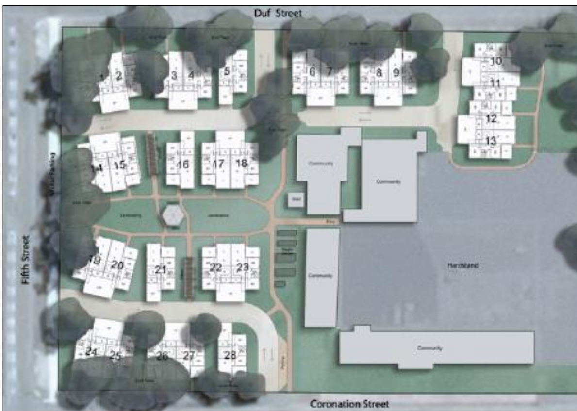
FIGURE 3 – MASTER PLAN CONCEPT

Figure 3 provides a copy of the Master Plan Concept contained in the DA.