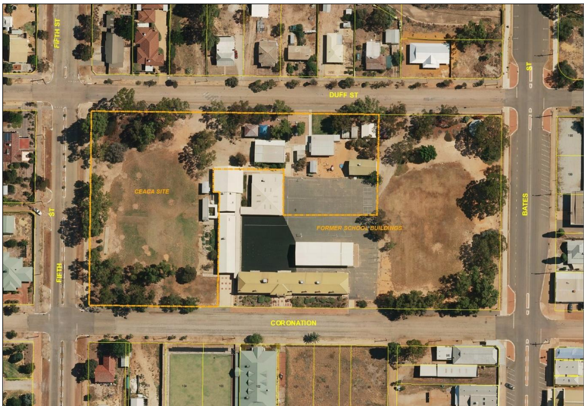
FIGURE 2 – AERIAL PHOTOGRAPH OF SUBJECT LAND