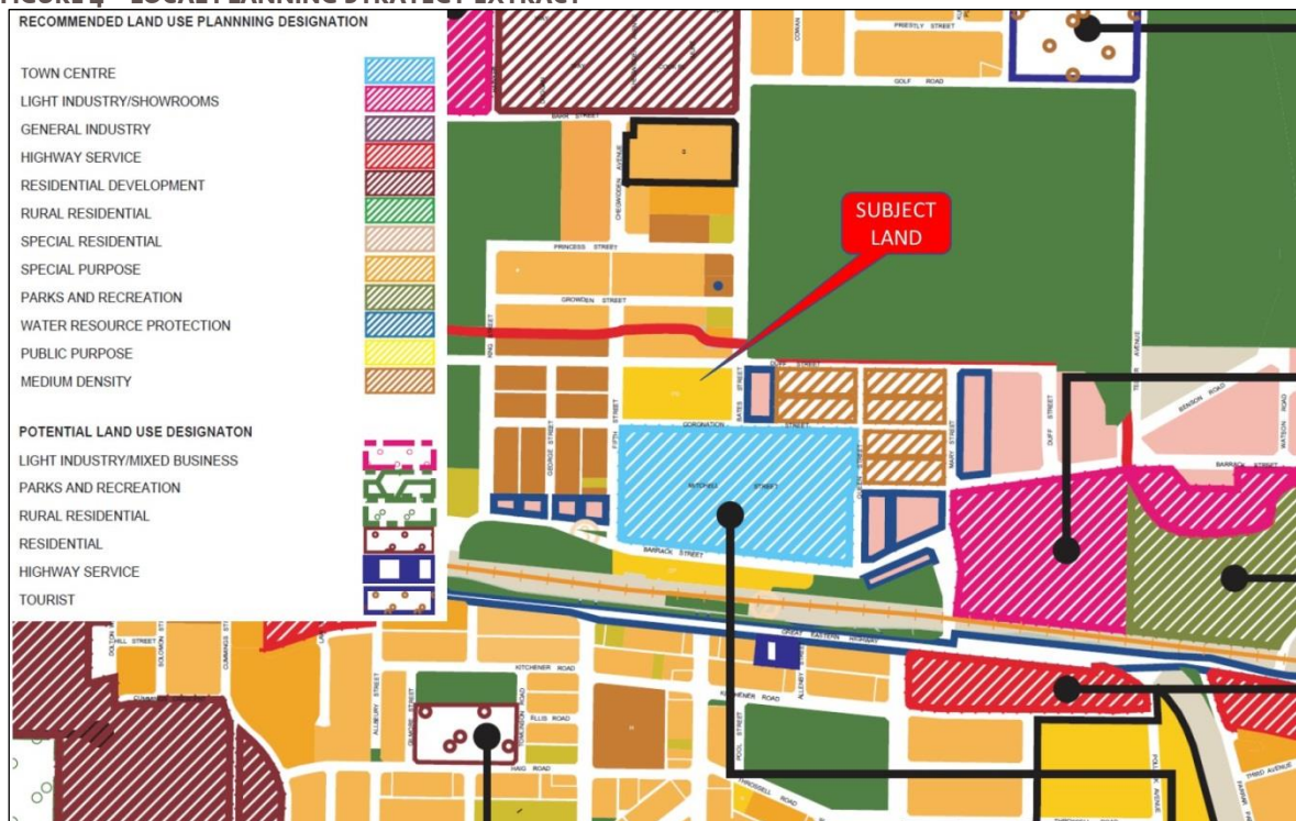
FIGURE 4 – LOCAL PLANNING STRATEGY EXTRACT