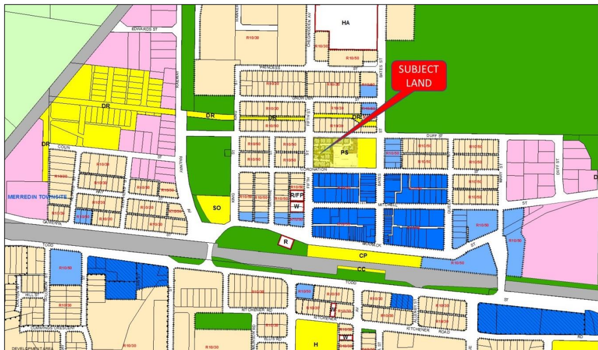
FIGURE 1 – LOCATION PLAN

Figure 1 shows the location of the proposed development in respect to the Merredin townsite zoning. The subject land is currently designated as 'Public Purposes – Primary School'. The Figure shows the land on the north and west is zoned Residential, whilst the land to the south is zoned Commercial. The Commercial land facing the proposed site is currently developed with a dwelling and a bowling green.