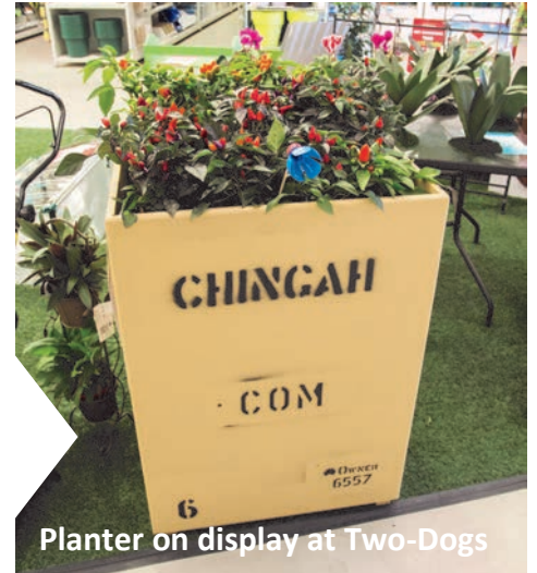
Planter on display at Two-Dogs

If you are interesting in displaying your family's wool brand, or if you would like to help in maintaining the plants please contact Marilyn on 9041 1611 or project1@merredin.wa.gov.au