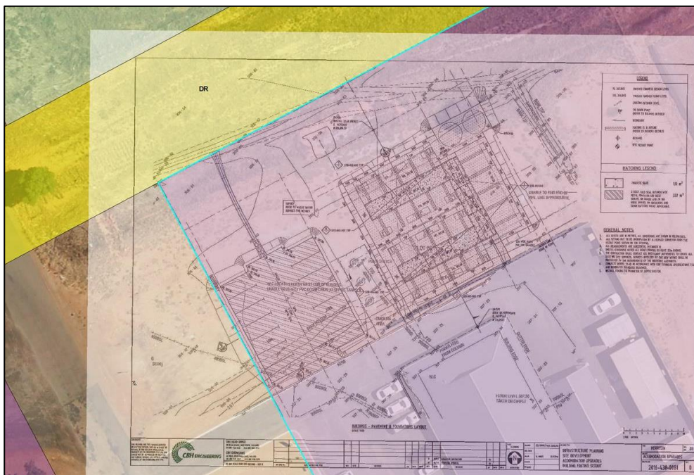
FIGURE 2 – DEVELOPMENT PROPOSAL

Figure 2 shows an enlargement of the proposal overlaid in the LPS6 map.