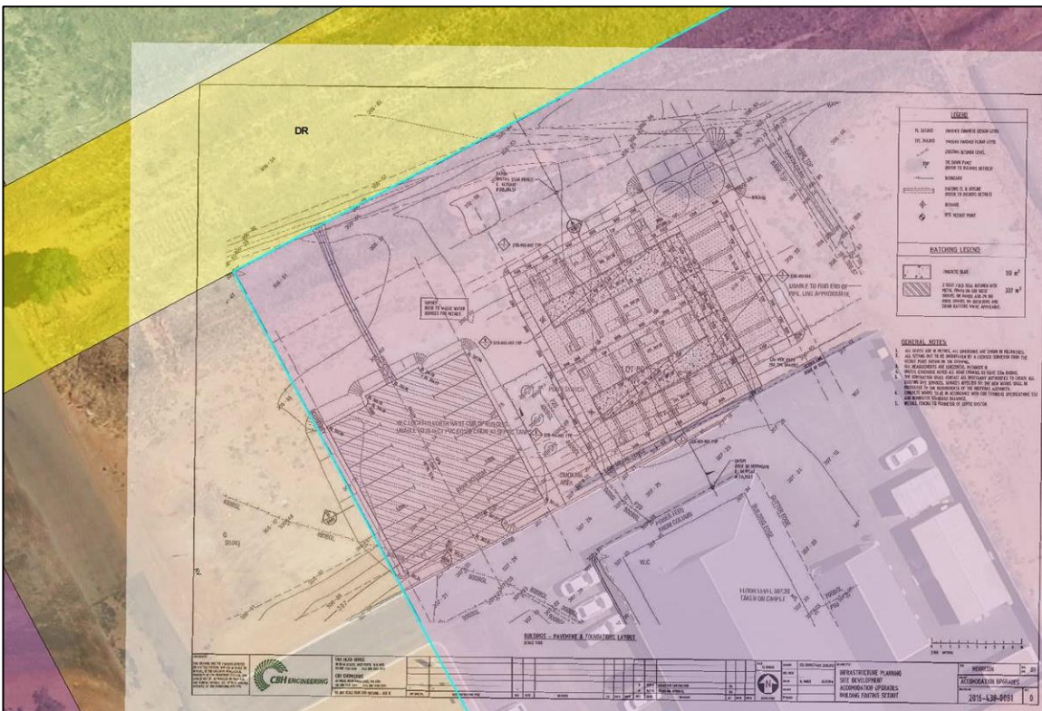
FIGURE 2 – DEVELOPMENT PROPOSAL

Figure 2 shows an enlargement of the proposal overlaid in the LPS6 map.