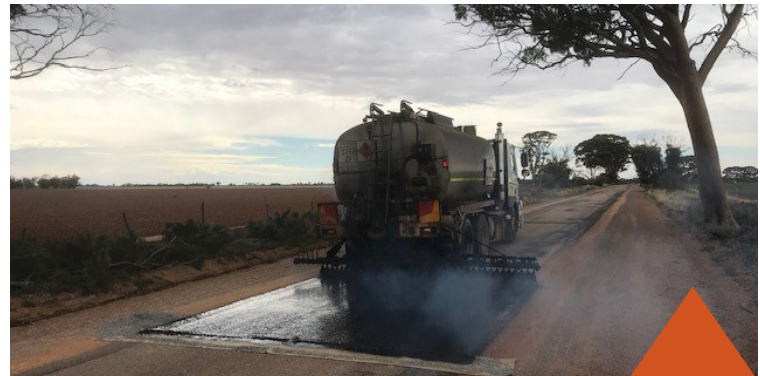
Contractors completing the Nukarni West Road