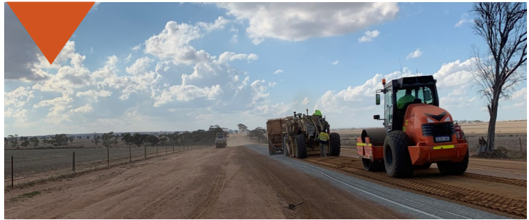
Contractors completing the Merredin—Narembeen Road

Cement stabilisation works have been on-going on the Merredin—Narembeen over the month of April. The works span more than 7kms, with the Shire outside crew working closely with contractors to complete the project. Cement stabilisation works have also been completed on 1.5kms of Goldfields road.