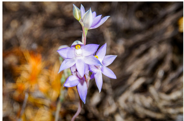
Sun Orchid found on Merredin Peak

Key spots in Merredin to see wildflowers include, Merredin Peak, Tamma Parkland, Caw Street, Scott Road, Totadgin Conservation Park and corner of Merredin Chandler and Talgomine Reserve Roads. The visitor centre produces a wildflower guide each season detailing what is currently flowering and where. We also have a wide selection of handy books to purchase to help you identify species out in the field.