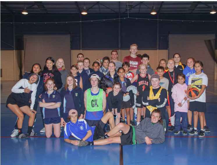
Week 1 Basketball Workshop

The next six-week block of night sports return to Merredin on Friday, 16 October 2020, with similar sports and new workshop topics. We hope to see many new and familiar faces for fun filled Friday night activities.