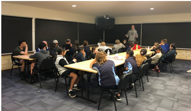
Week 1 Workshop with Cooper Creek

As well as playing sport for the past six weeks, the youth also engaged in life skills workshops which were educational, fun, and interactive. Many of the local organisations such as the police, volunteer fire department, youth officers, school-teachers and athletes gave presentations that were both insightful and engaging for the youth. The topics included alcohol abuse, mental and physical health, lighting fires, athlete journeys, sexting and online grooming. The workshops were a great aid in developing the youths' knowledge and learning.