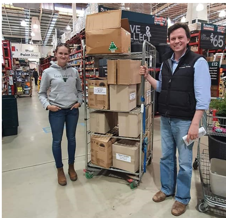
Merredin Farms collecting the delivery from Bunnings