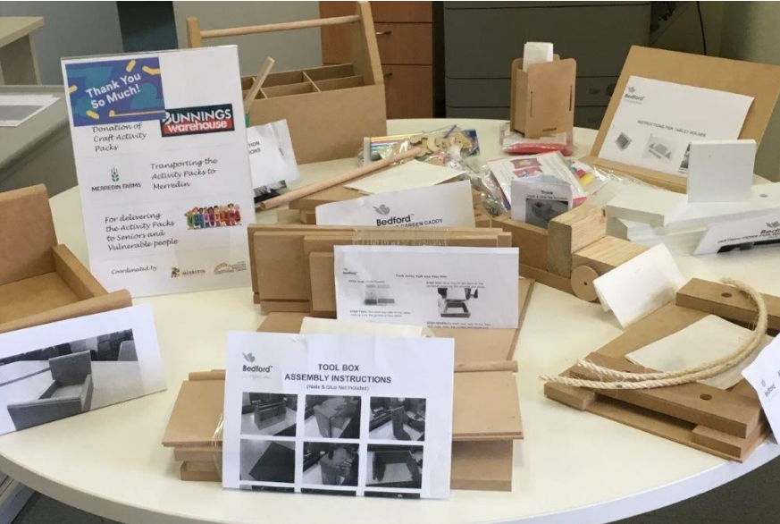
The packs available for collection Cont. Next Page - >

Our residents have begun to receive the packs which comprised of materials and instructions to build and create their very own crafts. The projects included making windowsill planters, decorative Christmas trees, tablet holders, garden caddies, and small trucks.