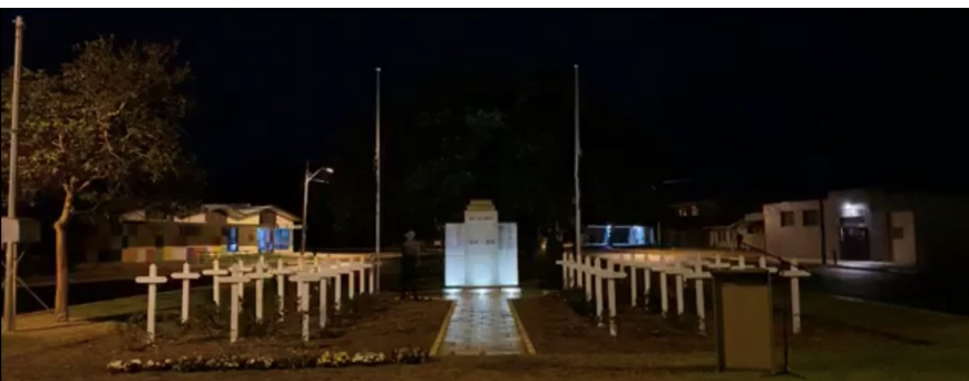
The Service was situated at the Merredin Cenotaph.

The morning was still, the only noise to be heard the patter of raindrops as they splashed on the pavement below. At 5.58am the stream went live on the Shire of Merredin Facebook page and before long nearly 200 households were watching together online, waiting in silence and looking out at the familiar white crosses and soldier silhouettes.